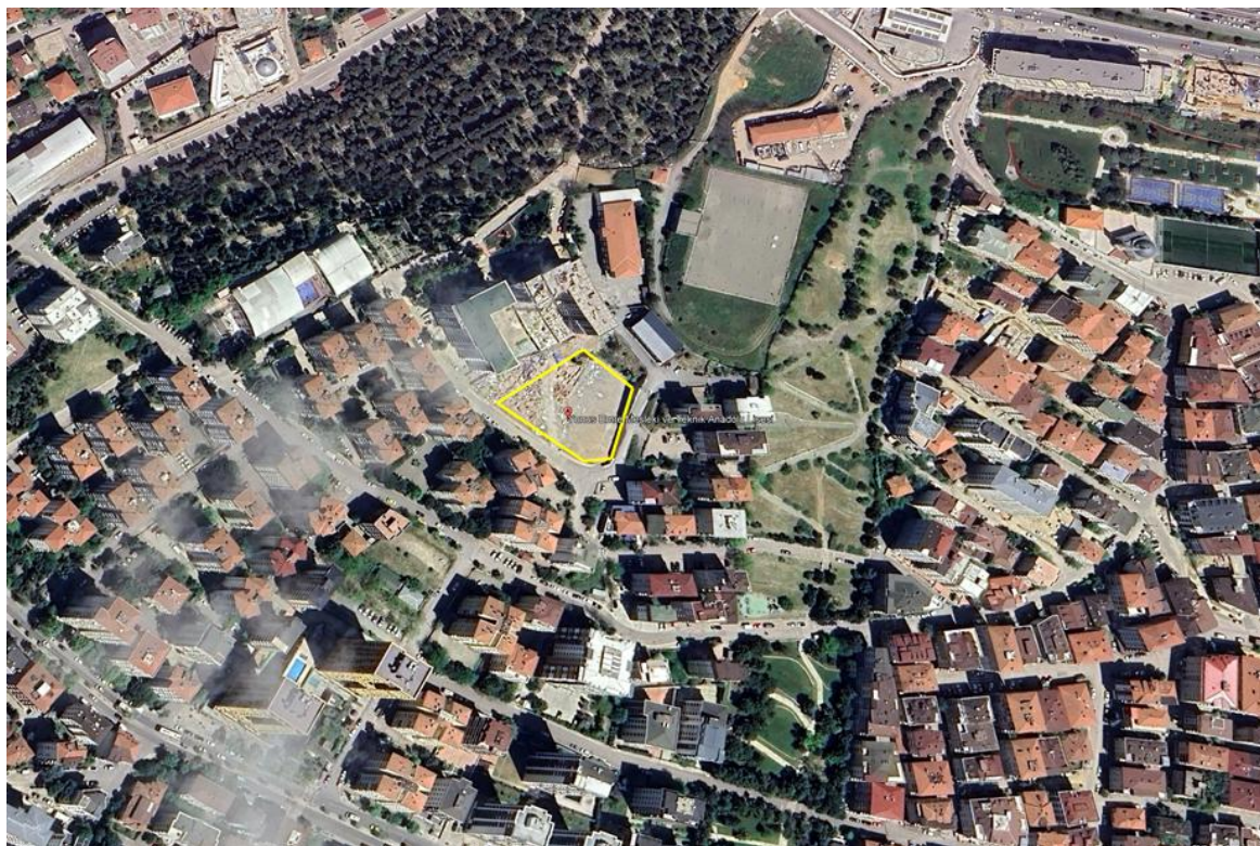
Figure 1: General View of Yunus Emre Vocational and Technical High School (Pendik, Istanbul)

detailed information on the site's existing elevation, boundaries, and physical features, supporting the design and layout of the new school building. Annex 5 (Zoning Status Letter) includes the official confirmation of the land-use designation and verifies that the site is planned as a High School Area under the applicable zoning plans.