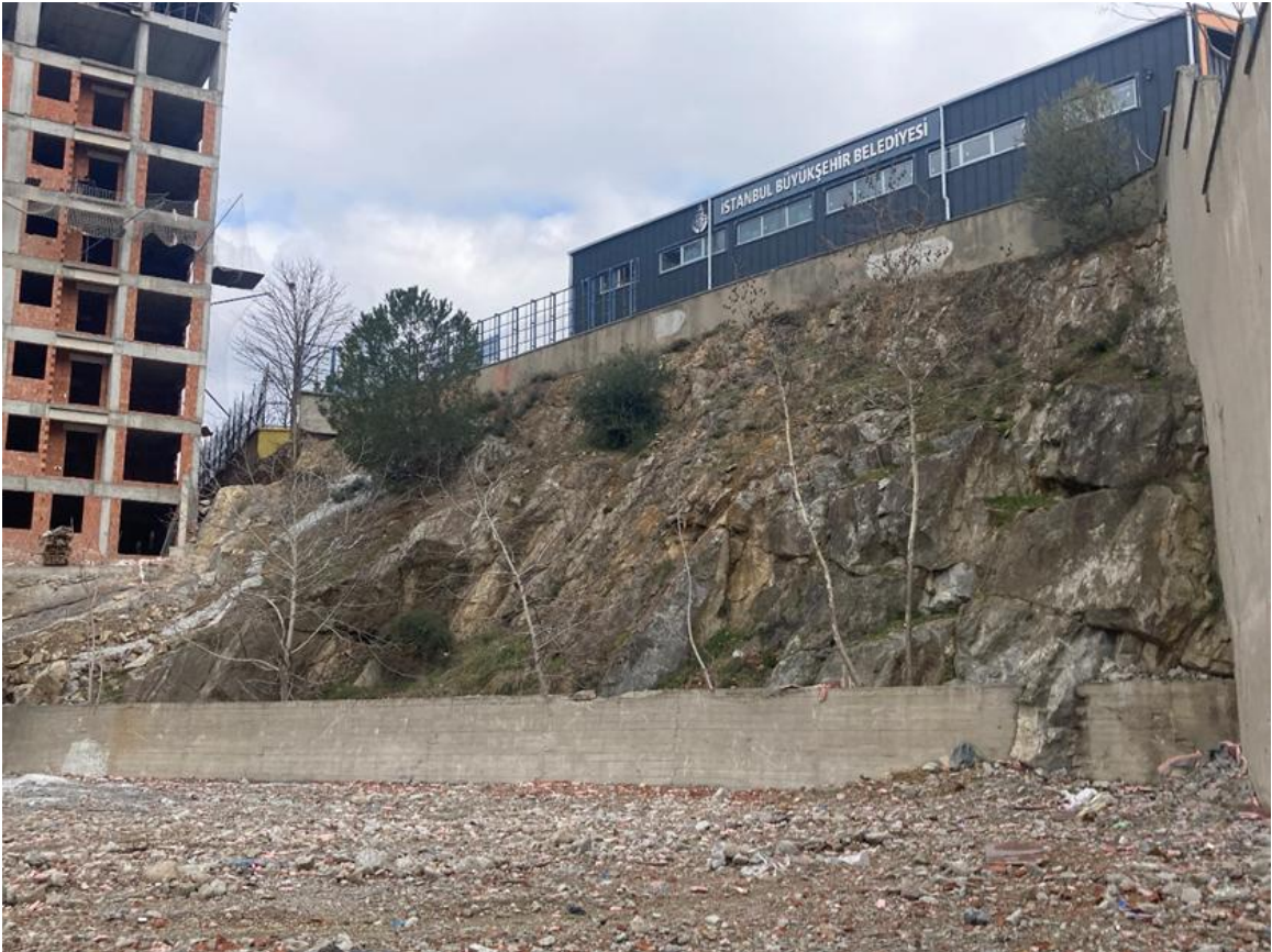
Photos 1-2-3-4-5-6: Project Area